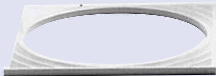
Square Ring Seat