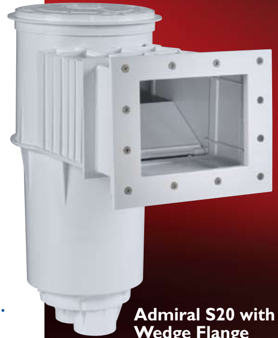
Admiral S20 with Wedge Flange