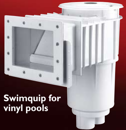
Swimquip for vinyl pools