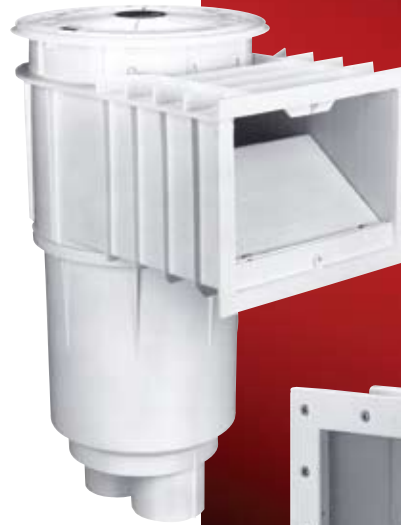
Swimquip for concrete pools

The low profile design of Swimquip® is ideal for new and retrofit installations. Available in white, gray and tan, with models for both concrete and vinyl pools.