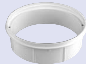
Gunite extension collar— available in white, tan or black