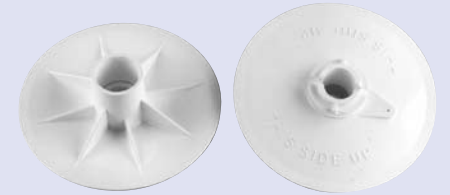
Vacuum plate/insert assembly