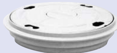
Lid with Ring Seat