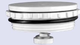
Equalizer valve assembly