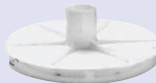
Vacuum Plate Attachment