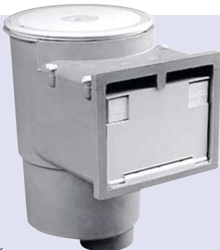
Also available for gunite pools SkimClean™ Residential Pool Skimmer

Fiberglass body with 1½" threaded ports, ABS