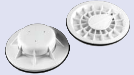
Float valve assembly